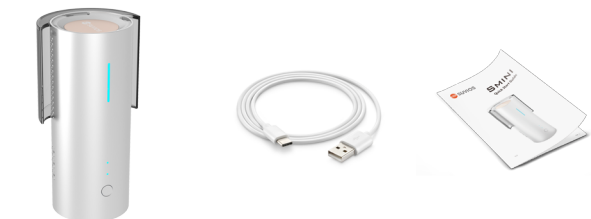
Smini (Wind Shield included)